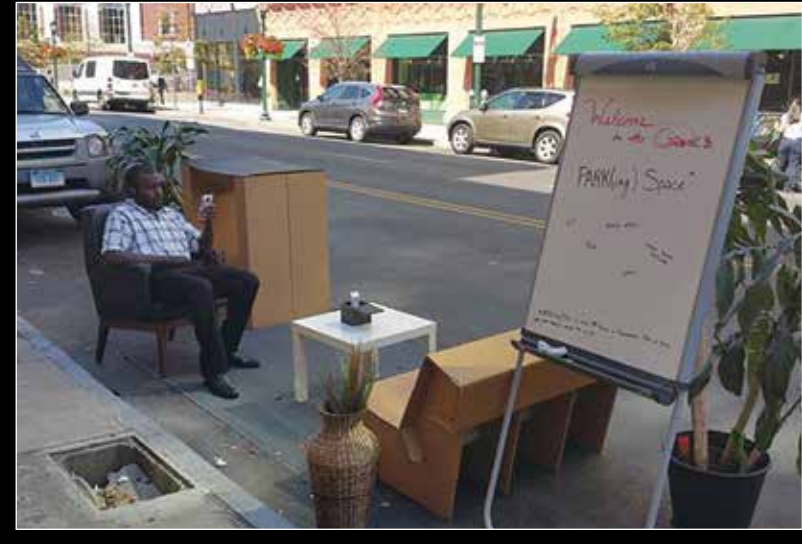
Photographer: Heather Sinisgalli City of New Haven, Conn.