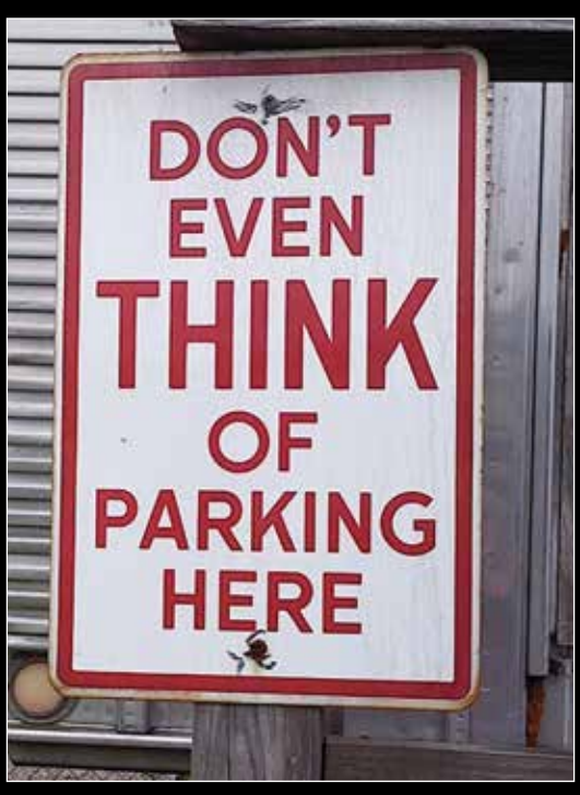
Photographer: Elise Hughes Bloomsburg, Pa. Police Department