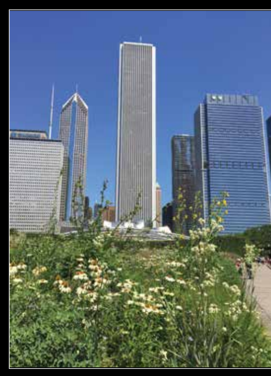
ECO Parking Lights