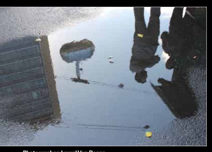
Oregon Health & Science University