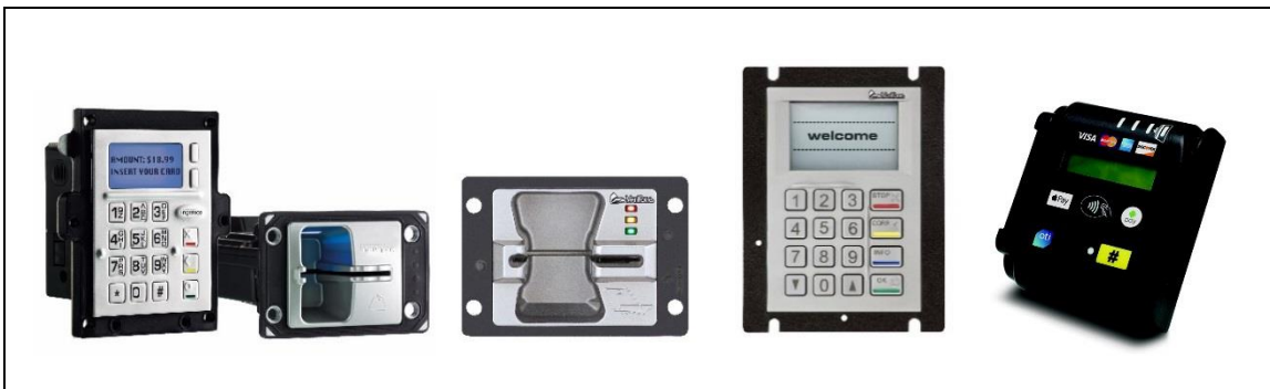
Figure 3. Examples of Chip-Enabled Devices for Kiosks 21

Examples of terminals that can be incorporated into kiosk devices are shown in Figure 3.