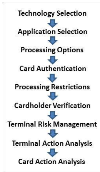
Figure 5. Processing Steps for an EMV Contact Transaction

The protocol for the interaction between the chip and the terminal in an EMV transaction is defined by the EMV specifications. The protocol prescribes a series of steps (Figure 5).