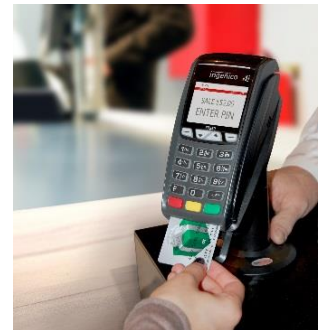
Figure 1. Example of a Chip-Enabled POS Terminal

The devices shown in Figure 2 are examples of EMV-enabled parking kiosks.