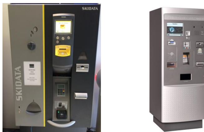
Figure 2. Examples of Chip-Enabled Parking Kiosks