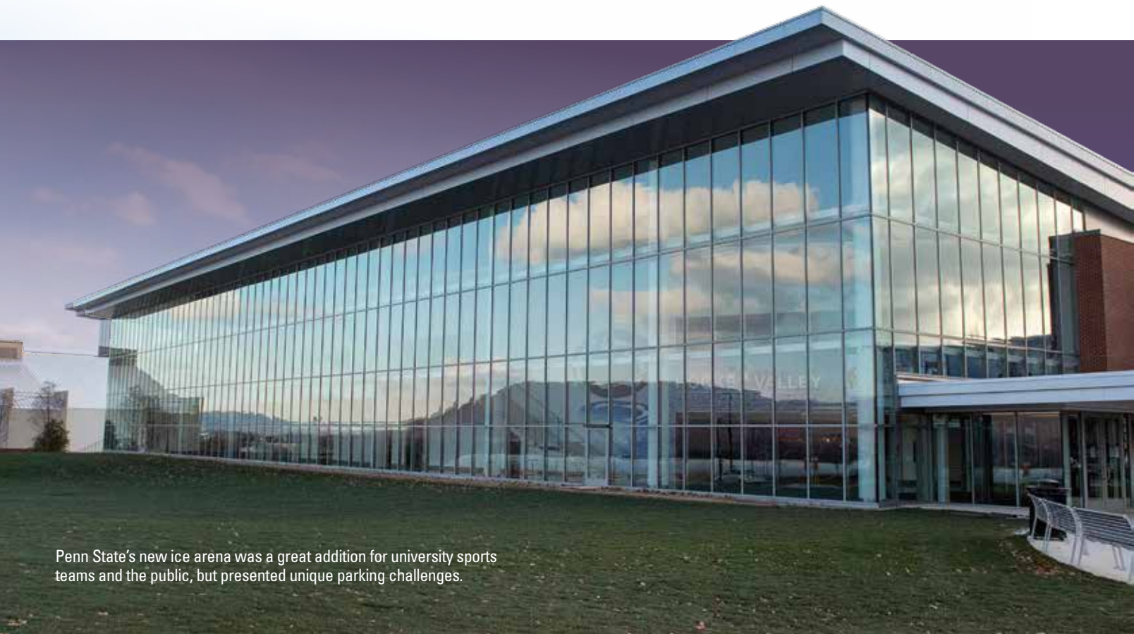
Penn State's new ice arena was a great addition for university sports teams and the public, but presented unique parking challenges.