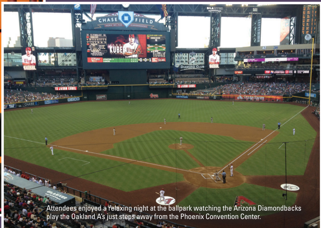
Attendees enjoyed a relaxing night at the ballpark watching the Arizona Diamondbacks play the Oakland A's just steps away from the Phoenix Convention Center.

She finished her talk by asking how many attendees had already installed chargers, and was surprised when many hands went up, saying she looked forward to more discussions between the auto and parking industries as technology moves forward.