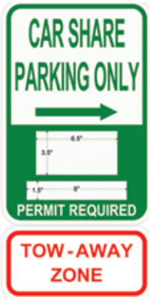
Signage was installed to clearly mark car share spaces.

Dedicated space permits have signage installed by the public works department that demarks each space with the car share company's logo. Operators are required to have their logos visible on the vehicles for both customer recognition and enforcement purposes.